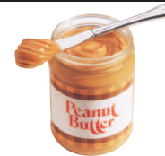
Peanut butter 2 tbsp (equivalent to 2 oz)