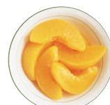
Raw, canned, or cooked fruit ½ cup