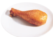
Cooked lean poultry, fish 3 oz