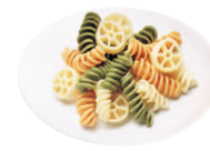
Pasta, rice, grits, cooked cereal ½ cup (equivalent to 1 oz)