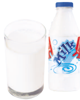
Milk 1 cup