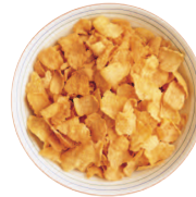
Ready-to-eat cereal 1 oz (equivalent to 1 oz)