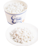
Cottage cheese ½ cup (equivalent to ¼ cup)