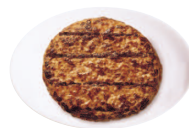
Cooked lean meat 3 oz