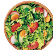
Raw leafy vegetable 2 cups (equivalent to 1 cup)